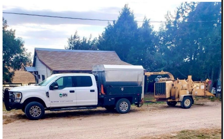
These are the vehicles and equipment used by 8N Tree Service.