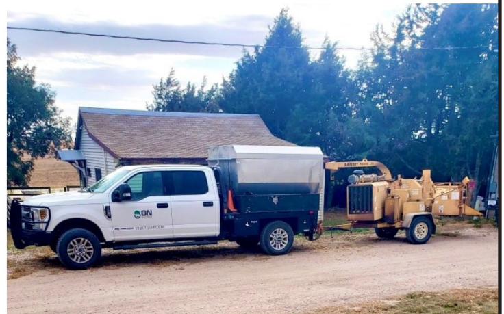
These are the vehicles and equipment used by 8N Tree Service.