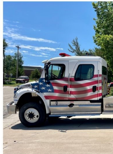
Sandhills Rural Fire Protection District