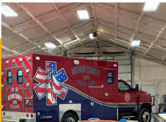
Arthur County Fire And Rescue