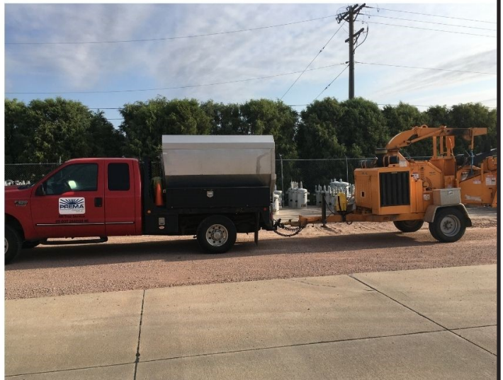
These are the vehicles and equipment used by 8N Tree Service.